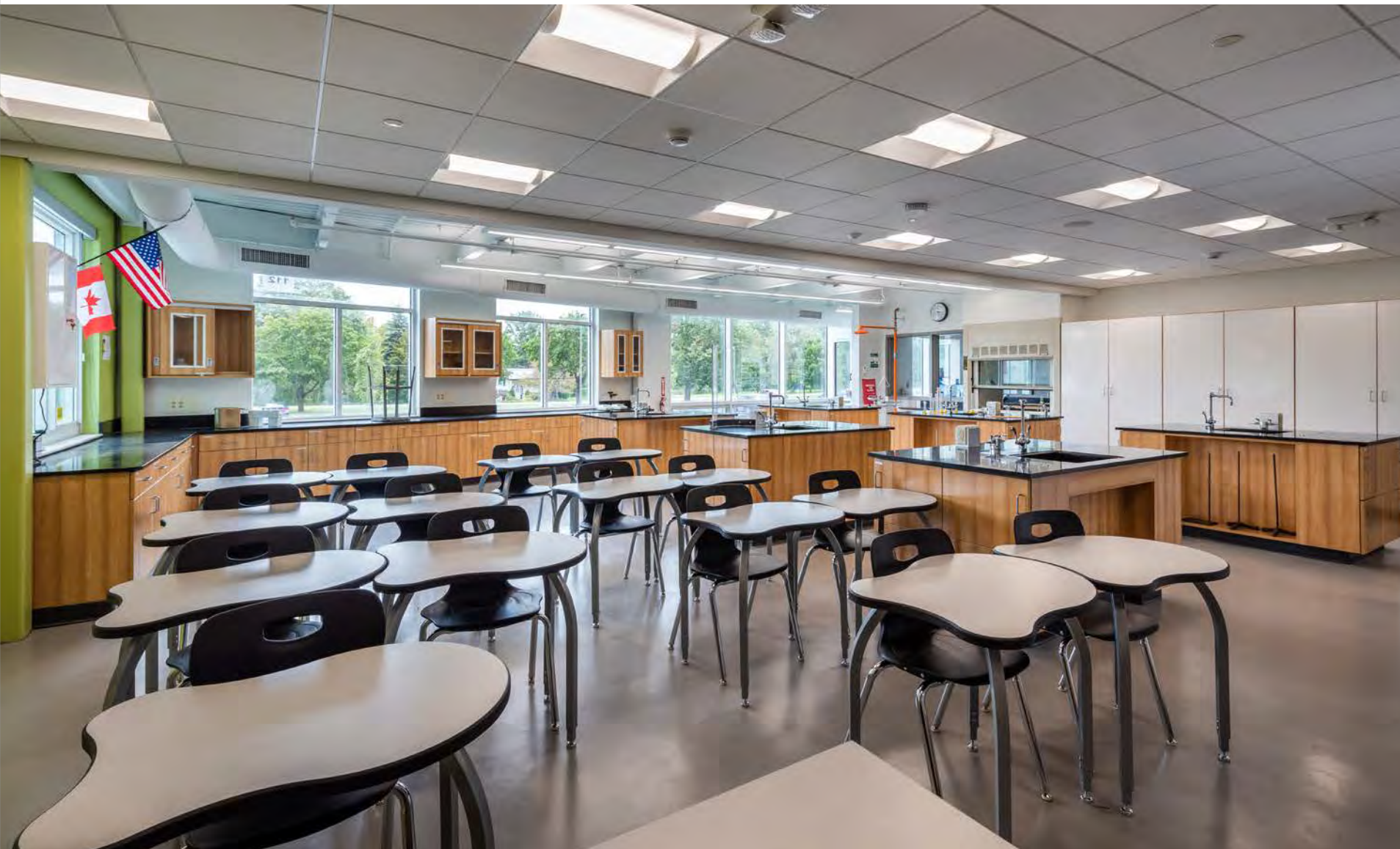
21st Century learning environments