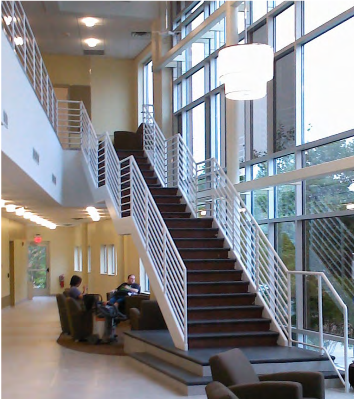
Schools of distinction