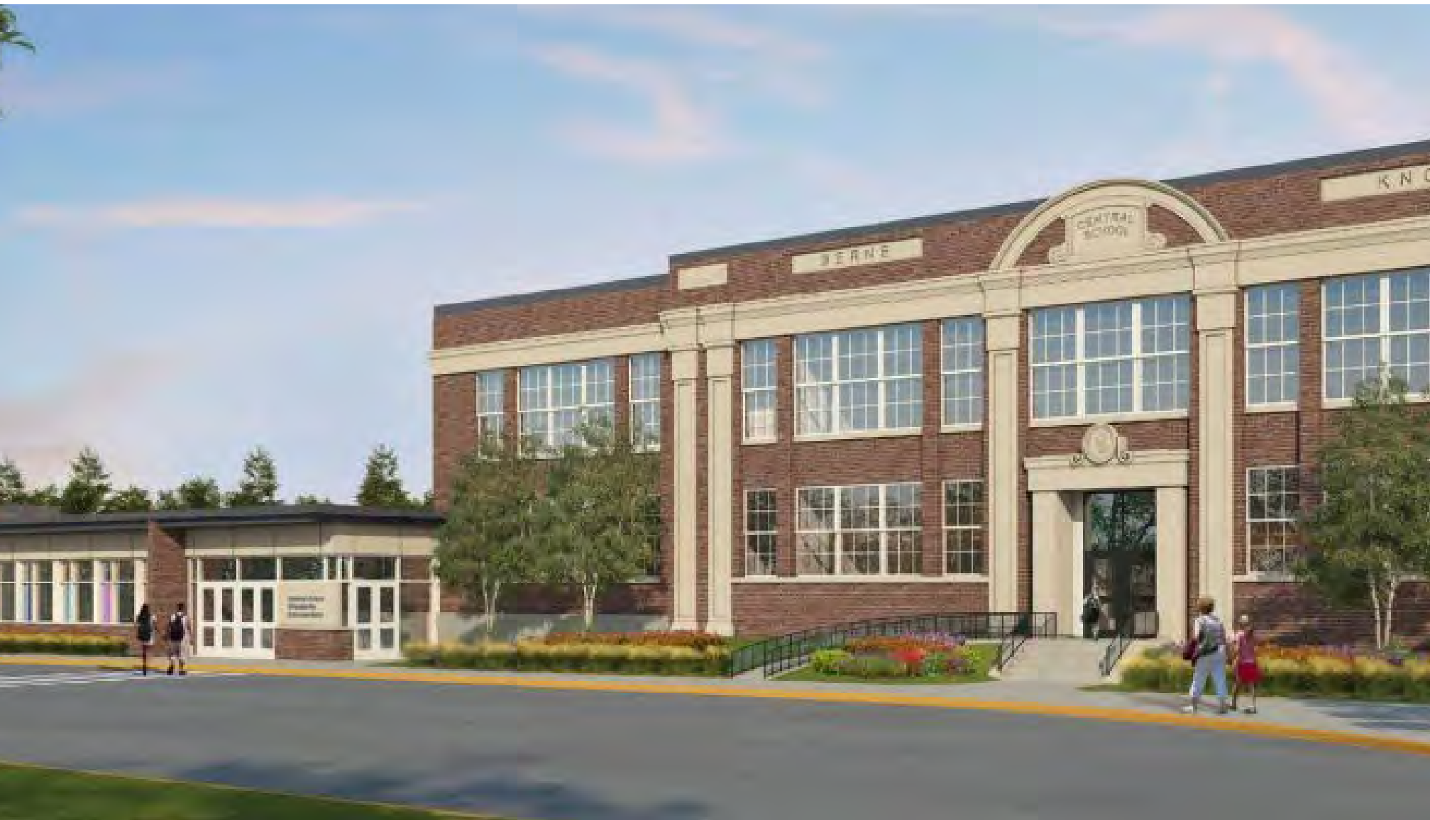
Artfully introducing contemporary programs to treasured older structures