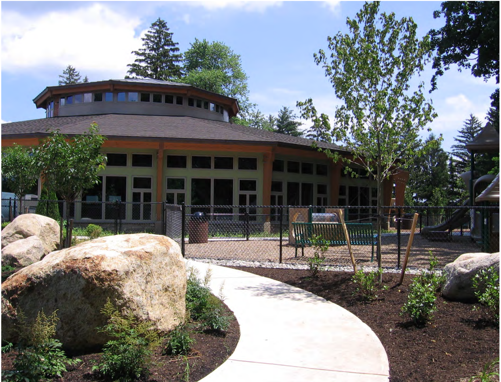
Unique educational environments