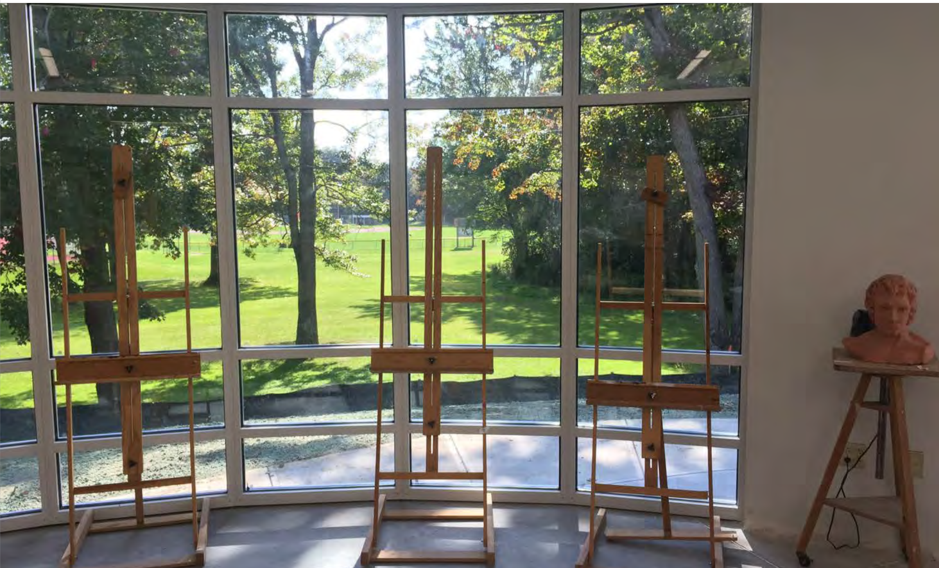
Providing learning environments that support the process and presentation of the arts