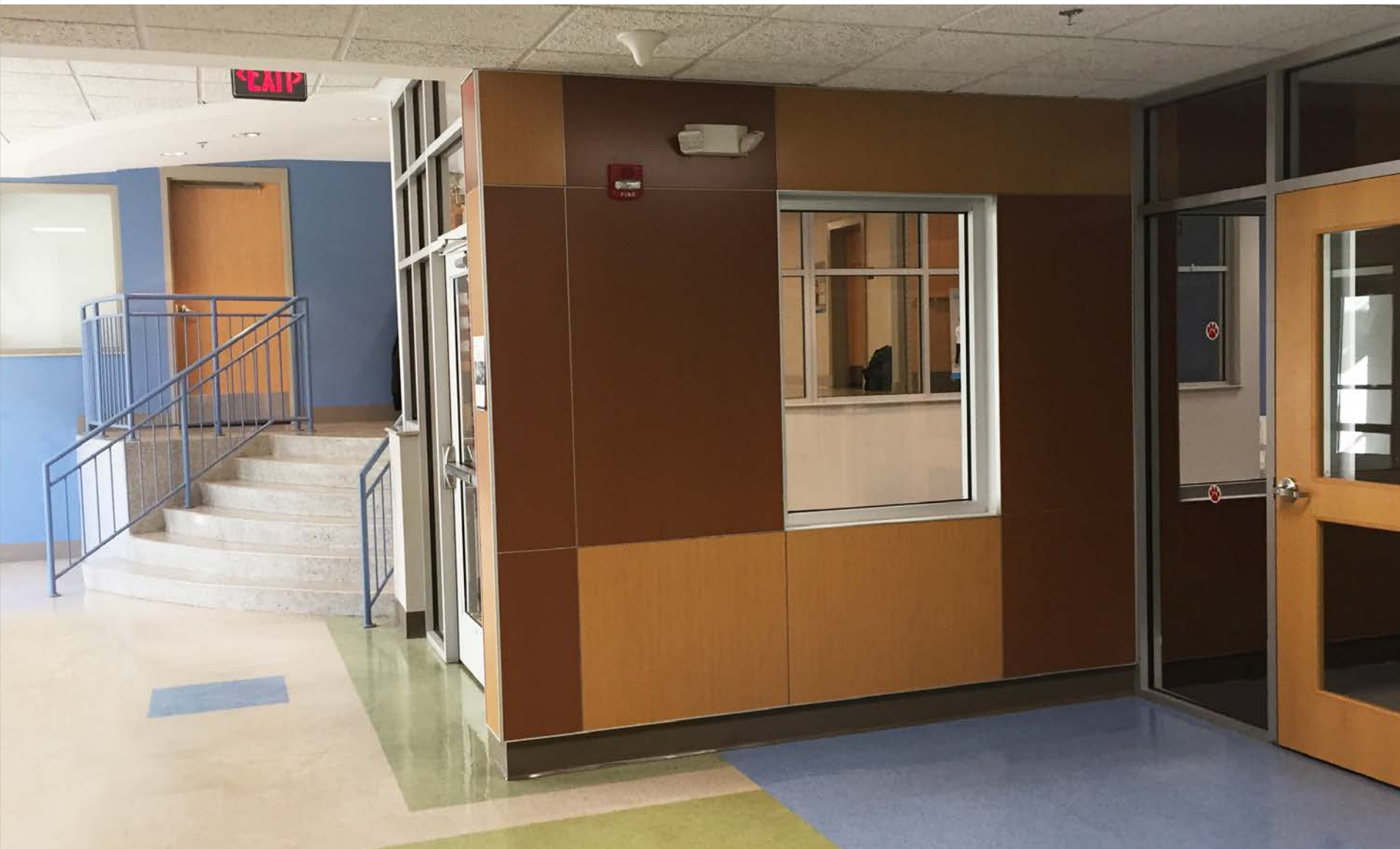
Secure entries that are student friendly environments