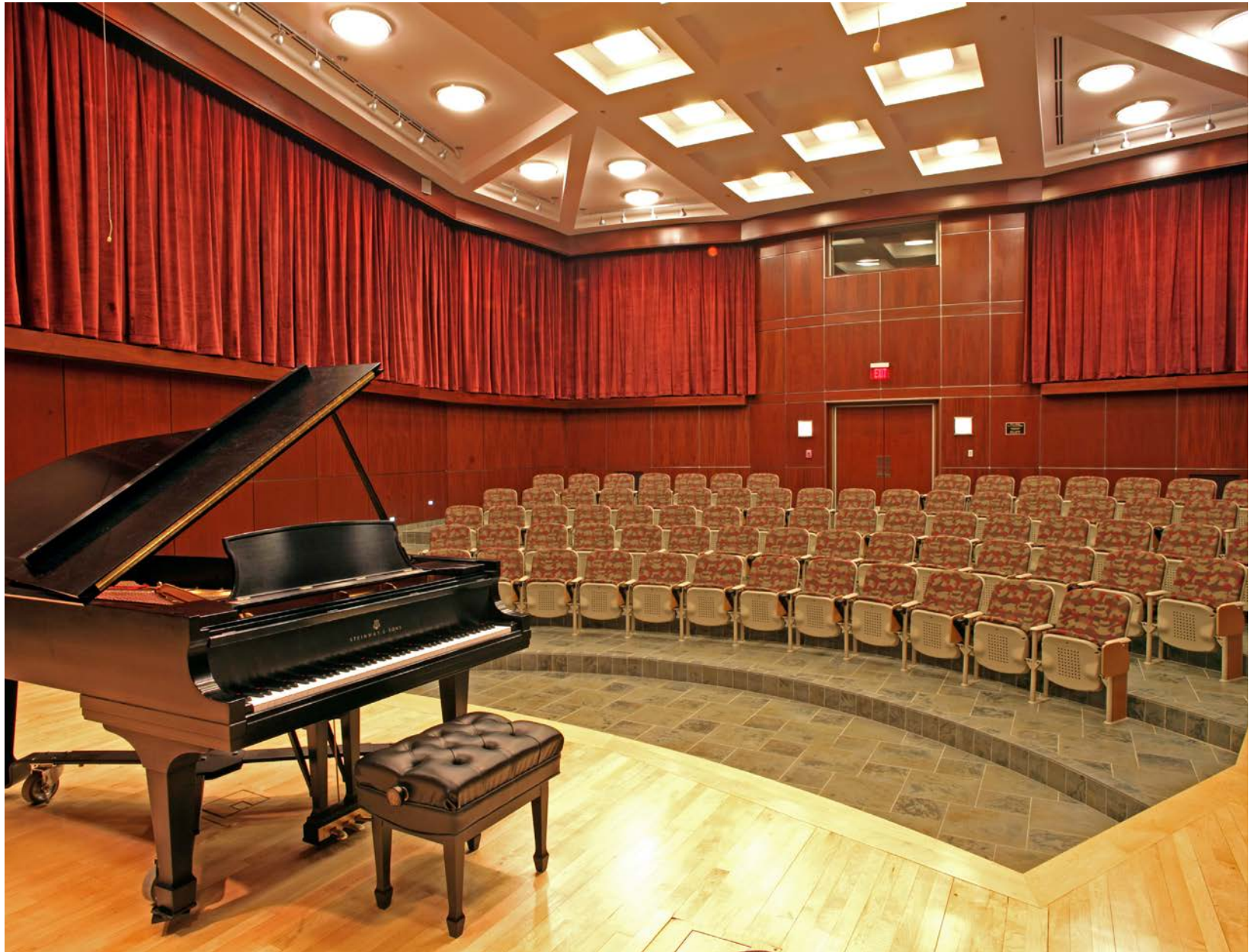
Supporting student performances with state-of-the-art facilities