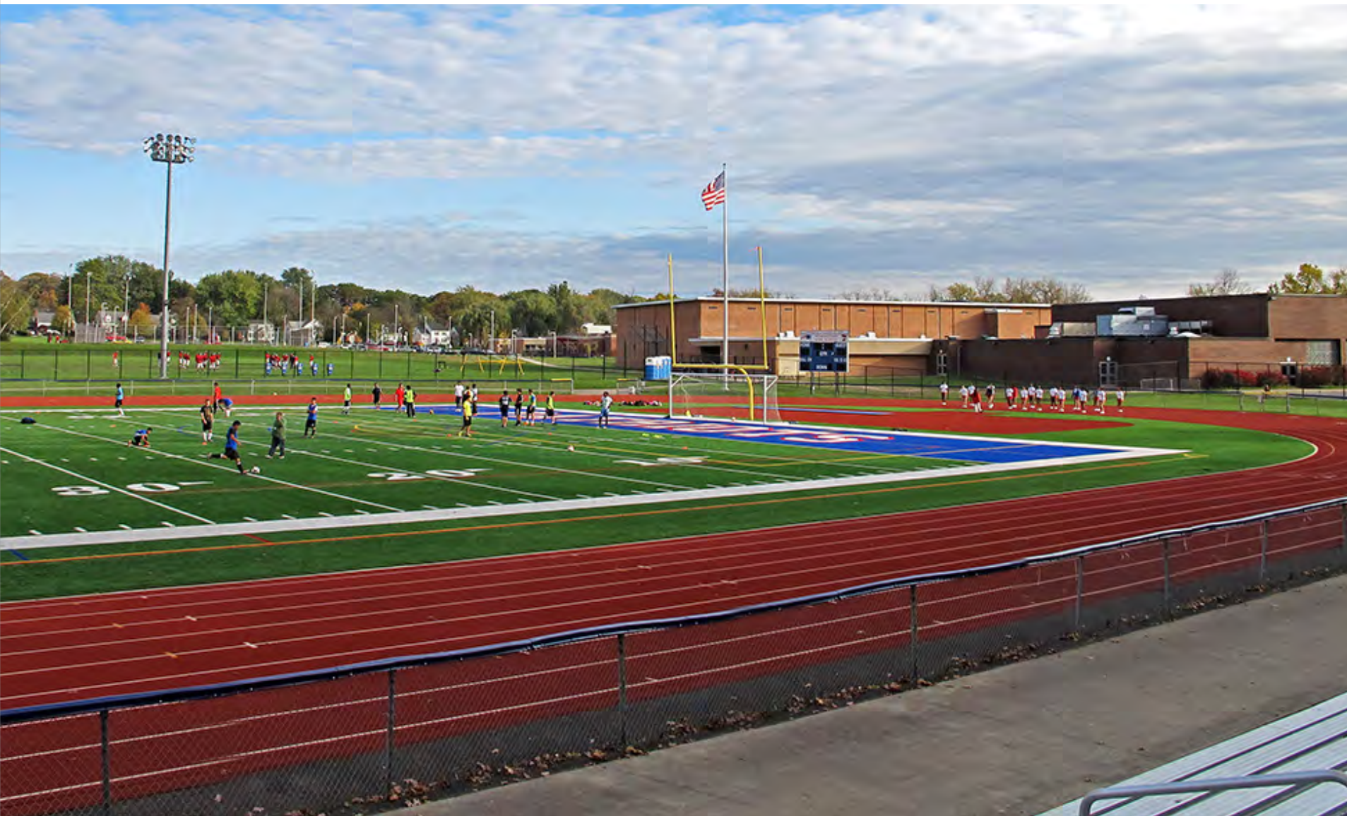
Developing facilities that support the student athlete and competitive play