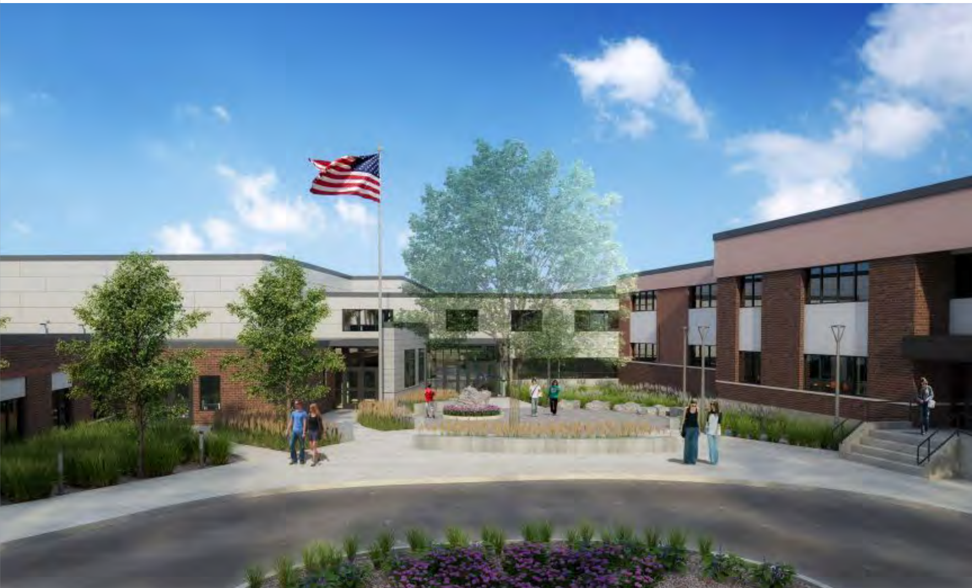
Community entries which support their civic purpose