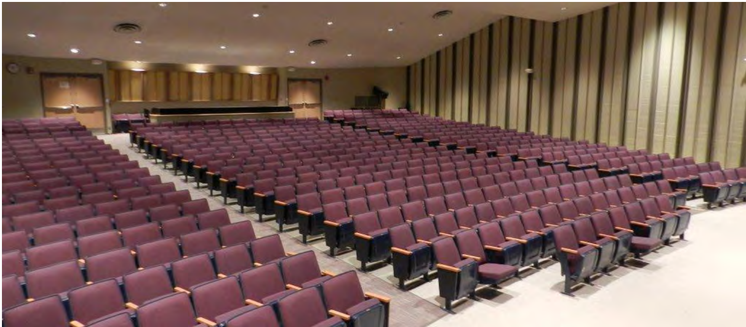
Restoring grandeur to aging community spaces