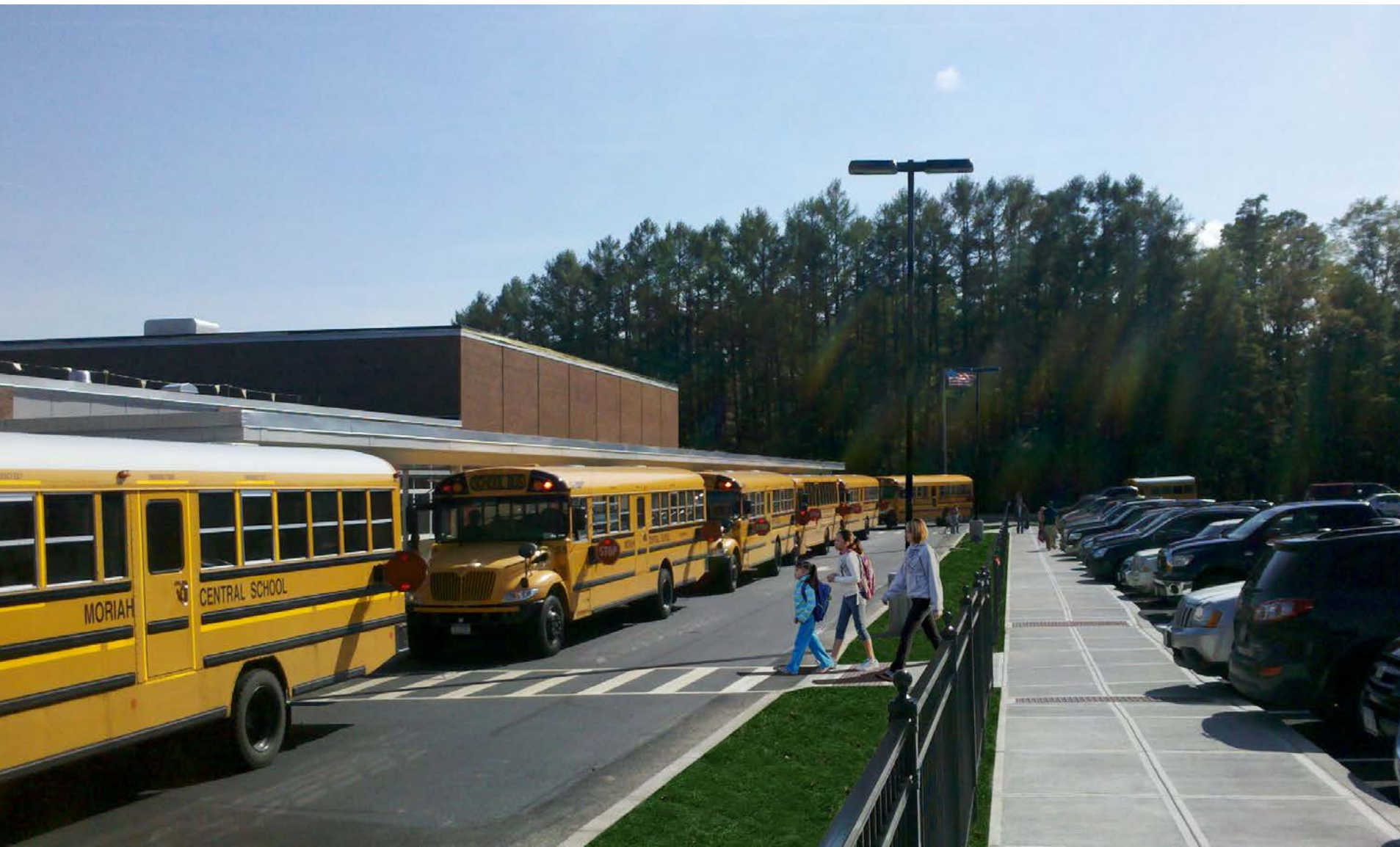
Traffic and pedestrian safety