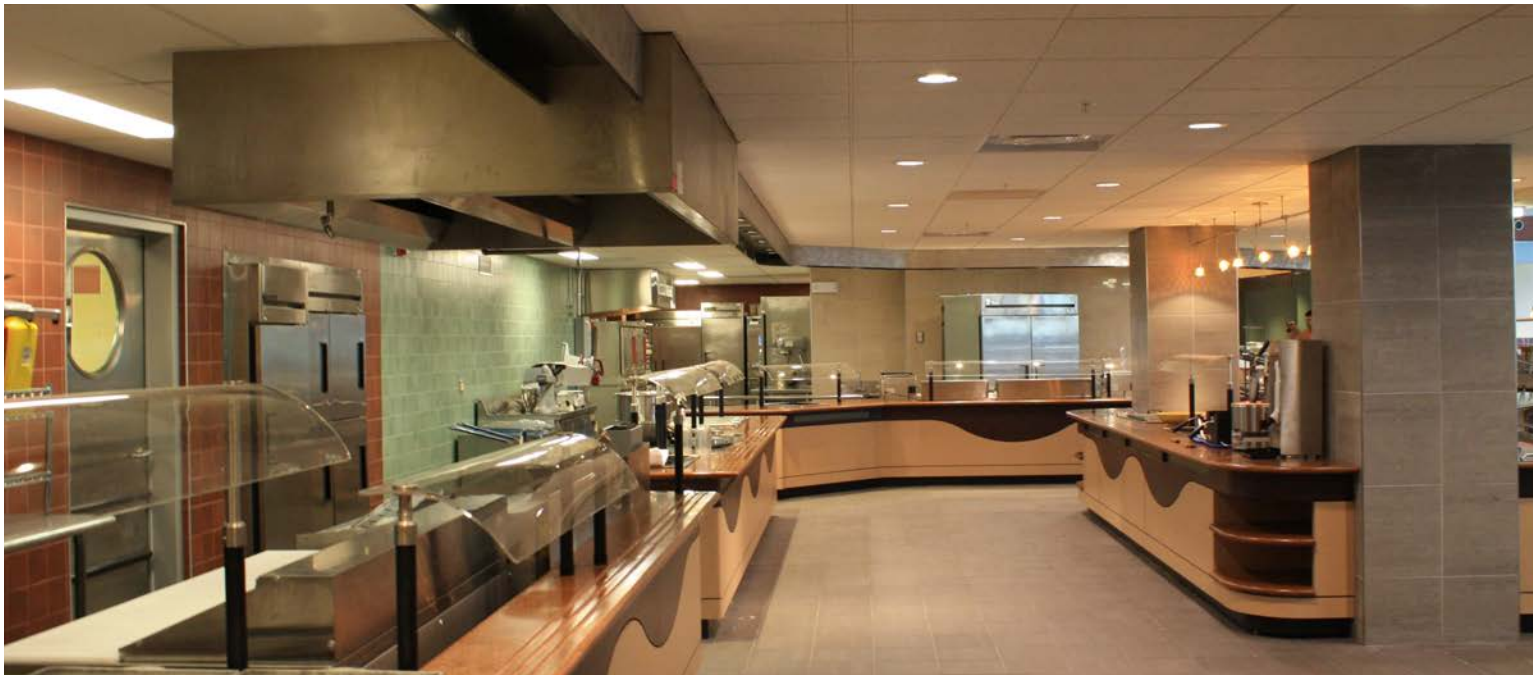
Valuing the student by providing non-institutional dining facilities